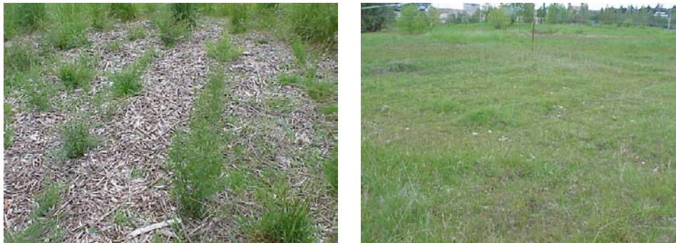
Figure 1: Typical mulched (left) and herbicide-treated (right) plots one year after installation; note the rows of mulched snowberry on the left, obscured by weeds on the right

Shortly before plant installation, each plot's soil was analyzed to ensure that texture, pH, bulk density, and moisture content were not significantly different. Starting in 2001, the plants have been monitored annually to determine their survival and growth rates; this monitoring will continue for five years. In addition, the height of each plant, from the root crown to the tip of the stem, is measured every other year. The relative success of the test plants and weedy invaders is also noted. Finally, the data are analyzed using single factor analysis of variance (ANOVA).